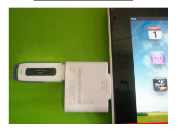
Ipad 1 / Ipad 2